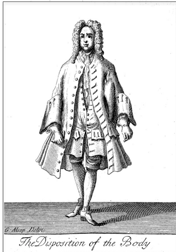
Figure 1: from John Essex, The Dancing Master (1728)

I grew up in the 1970s and early 80s, when disco music and dance was the big thing. My first experiences on the dance floor came from youth-club parties, where we tried to imitate the dances we had seen in American films such as Saturday Night Fever , Fame and Flashdance . Even though I was quite a clumsy dancer, I unconsciously emulated the attitudes and body posture of the actors and dancers in the films. These, along with the music and its rhythms, are fixed in my bodily memory and can be recalled at will. For someone growing up in the suburbs of Paris these days, body movement and posture is likely to be influenced by Hip-Hop and Breakdance. 2 These tacit models for the use of the body in a given time and place I call body paradigms .