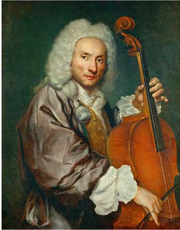
Figure 3: Giacomo Ceruti, Portrait of a cellist , ca. 1750.

If we observe paintings and engravings from the period, we can see that this paradigmic body use permeates the whole society. Depictions of musicians do not deviate from this paradigm, and the playing positions reflect the contemporary ideals of decorum and poise.