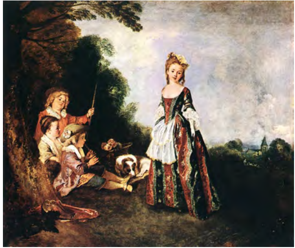
Figure 2: Jean Antoine Watteau, The Dance c.1720.

In the somewhat special case of Louis XIV, he even danced on stage at the tender age of eight.